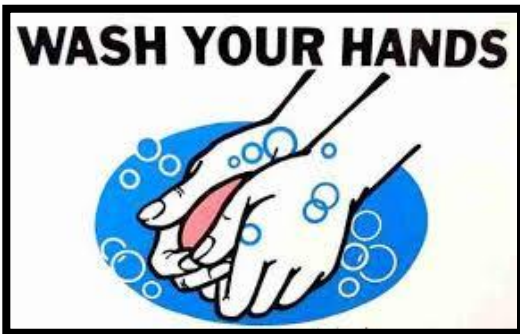
Hand washing mandatory upon arrival