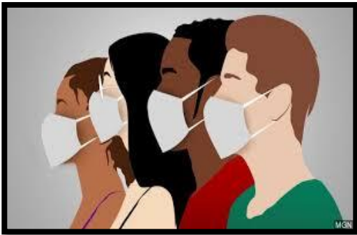
Mandatory face mask

Additional precautionary measures to ensure a safe environment for your PT visits include: