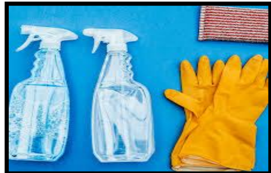
Equipment sanitized with each use